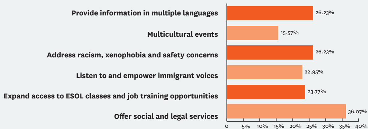
How can the community improve inclusion? *30

*Respondents were able to select more than one option